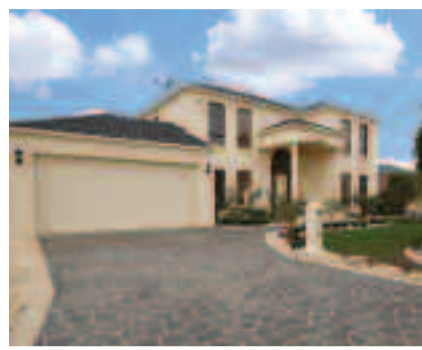
4 COLAC PLACE SPRINGLAKE