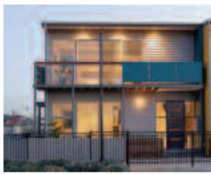
LOT 20 THE ESPLANADE TOWN CENTRE