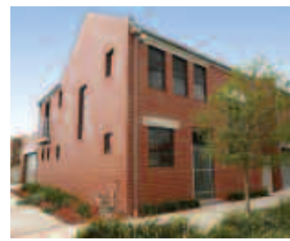
10 PEEL LANE THE GROVE