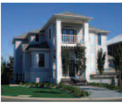
2 TOOLONDO CLOSE THE BRIDGES