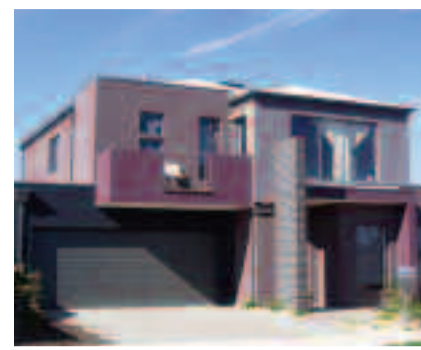
9 WATERSIDE DRIVE BURNSIDE